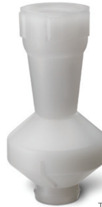
TankJet D26564 tank cleaning nozzle