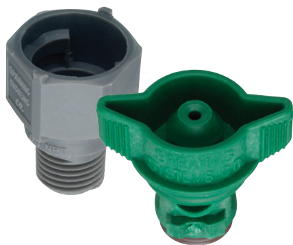
ProMax Quick FullJet®