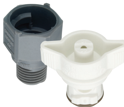
ProMax Quick VeeJet®

QuickJet spray nozzles require a quick 1/4-turn of the wrist to remove spray tips. No tools are required. These quick-change nozzles are ideal for areas where maintenance is conducted frequently.