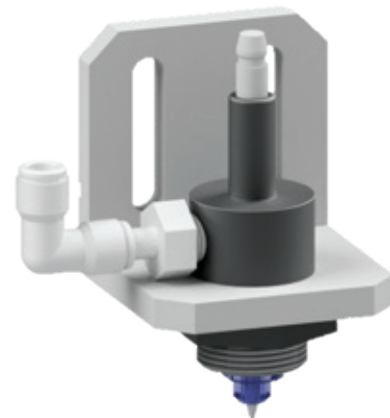
AutoJet Single-Point Continuous Nozzle