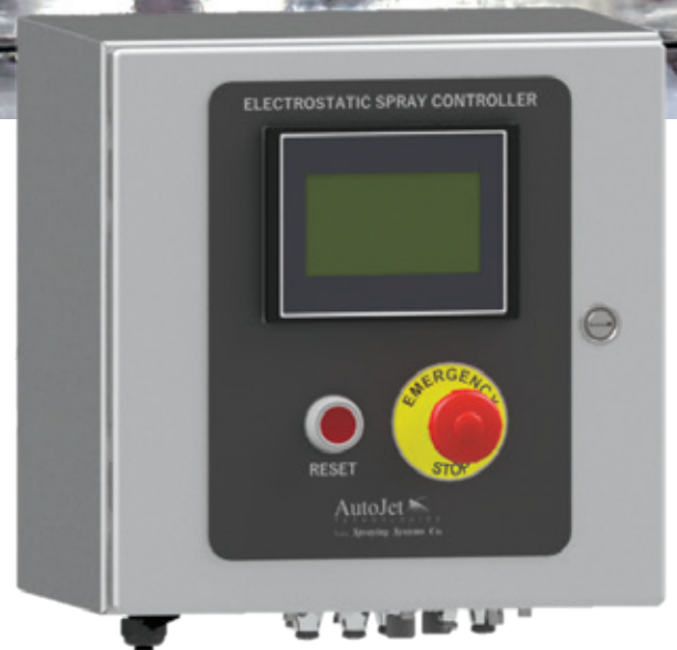
AutoJet Spray Controller