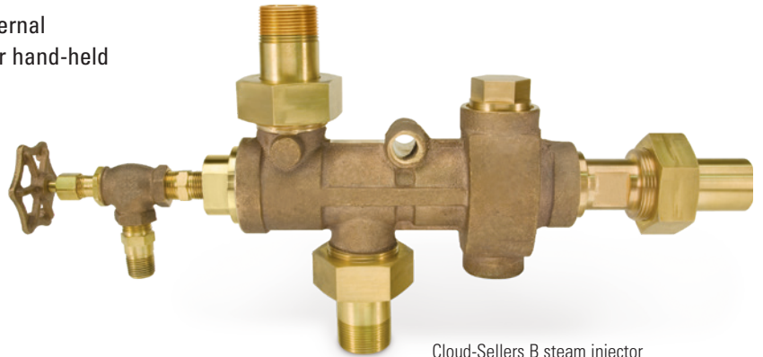
Cloud-Sellers B steam injector for liquid discharge capacities up to 34 gpm (129 lpm)